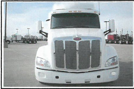
Remove factory bumper