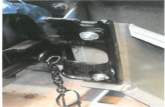
Support bumper and bolt bracket to frame (Do not fully tighten until all adjustments are made)