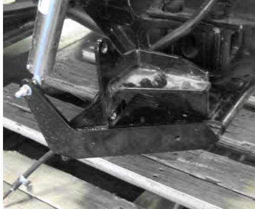
Frame Mounting shown