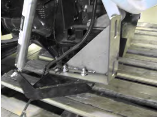
Replacement Bracket shown