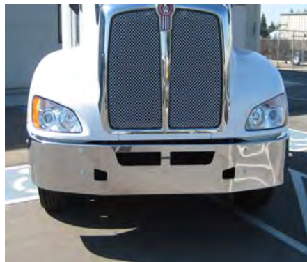
Premium Bumper Shown