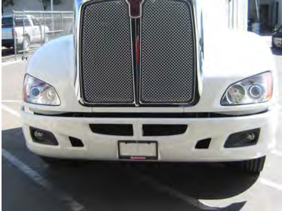
Factory Bumper Shown