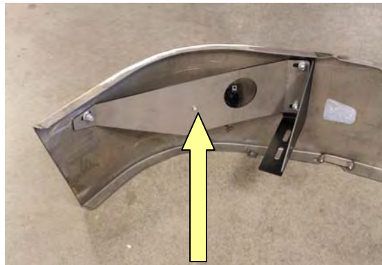
Step 10: Install ear support