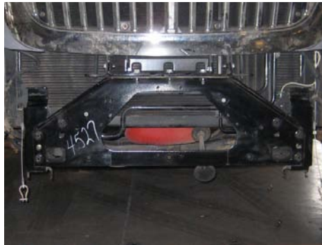
Step 2: Mount New Brkts to frame mount (Drvr & Psgr Sides)