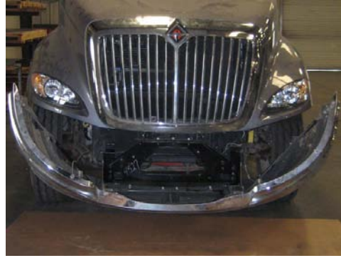
Tilt Down View