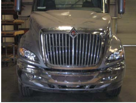
Step 1: Remove Factory Bumper